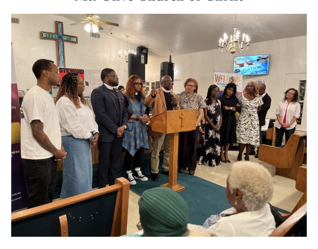
Outland Memorial AME Zion Church