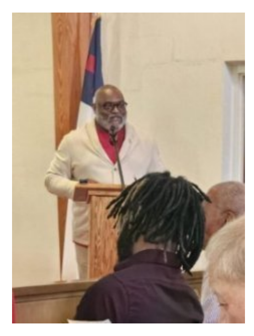
St. Stephen Metropolitan AME Zion Church